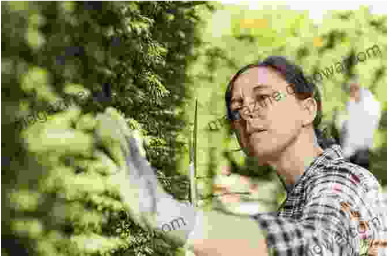
Caption: Rachel Carson, an influential conservationist and author

Beyond exploration and adventure, women have also been instrumental in safeguarding the natural world. Rachel Carson, known as the "Mother of Environmentalism," sounded an early alarm about the devastating effects of synthetic pesticides. Her groundbreaking work, Silent Spring , ignited a global movement that led to the creation of the Environmental Protection Agency.