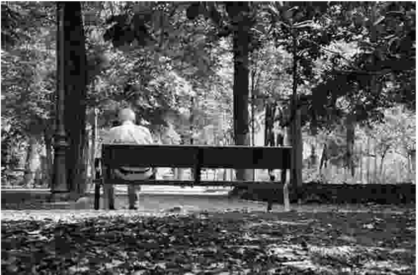
Joe Salerno, "Street Scene," 1960

Salerno's approach to street photography was characterized by his ability to blend into the background and observe his subjects without disturbing them. He possessed an uncanny ability to anticipate decisive moments, capturing the perfect expression or gesture that conveyed the essence of a scene.