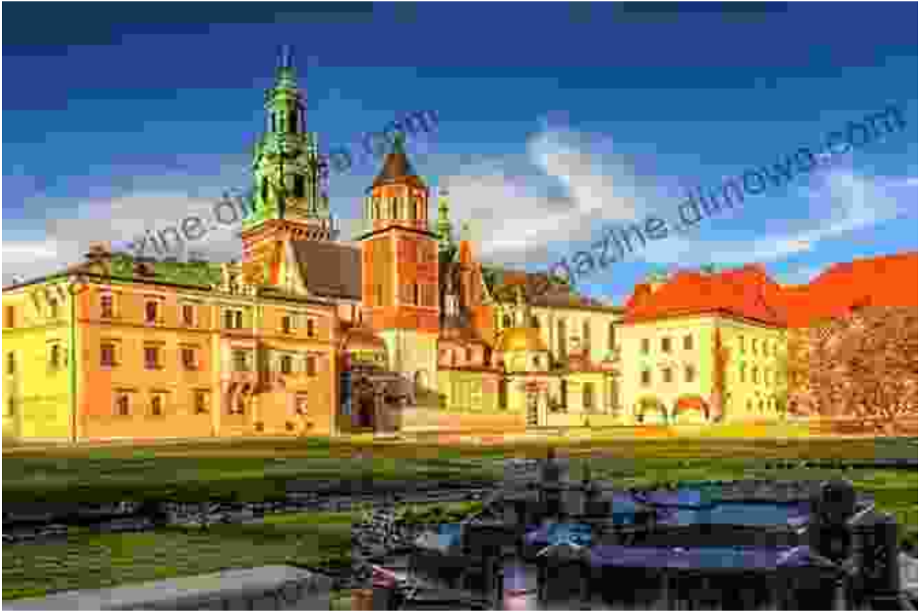
Wawel Castle, a magnificent royal residence and UNESCO World Heritage Site, overlooks the Vistula River.