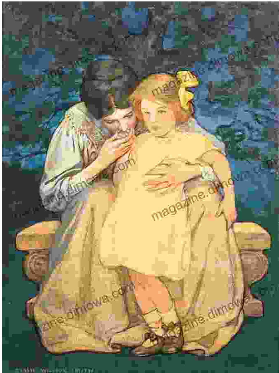
Illustration of children playing in the garden by Jessie Willcox Smith