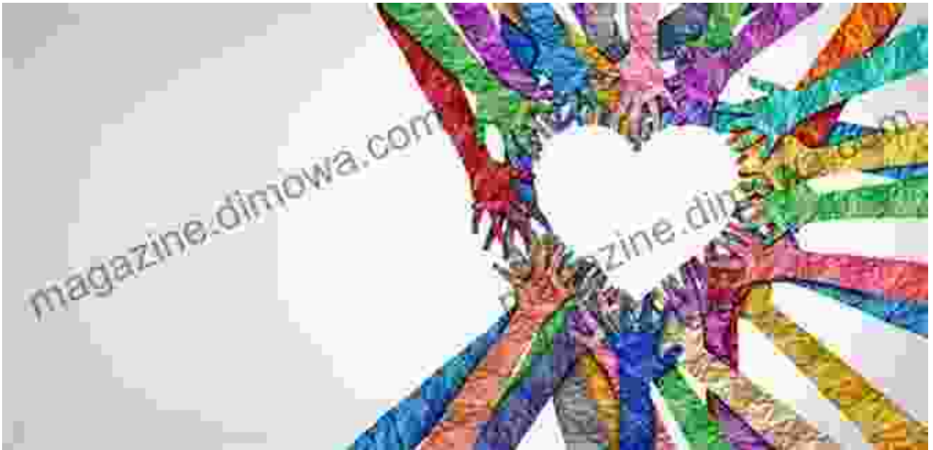
Intermarriage as a bridge between cultures