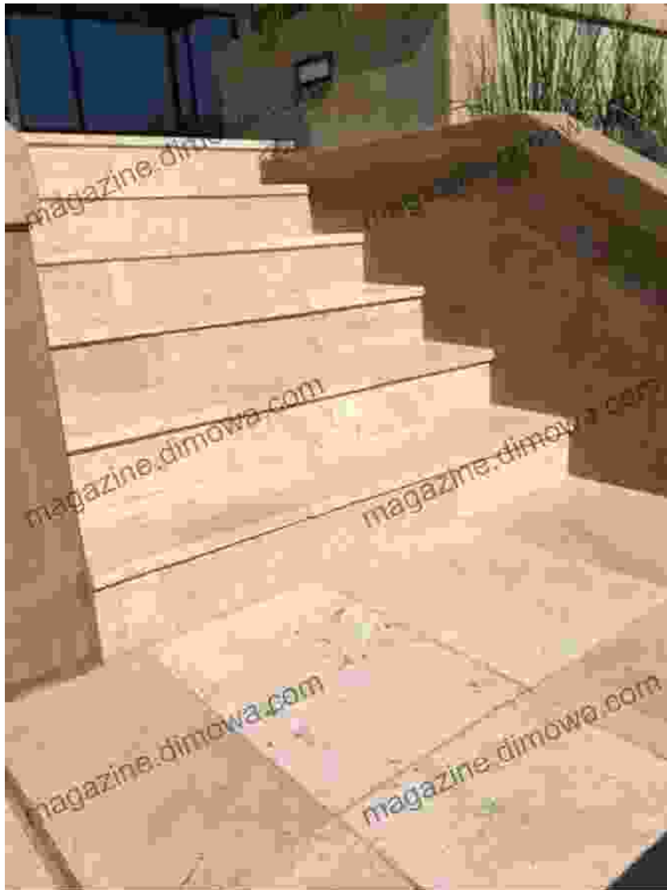
The vibrant hues of the terraces create a captivating spectacle.